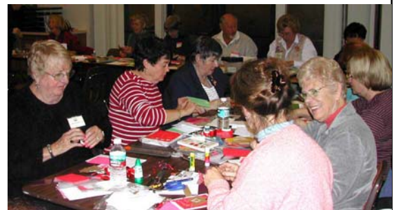
Hard at work on cards for Children's Hospital.